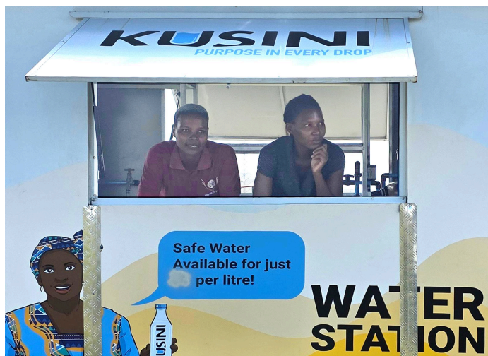
Enterprise (i-Spring Water solutions) in Komati supported through Indalo Inclusive @Indalo Inclusive